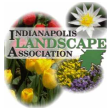
Indianapolis Landscape Association