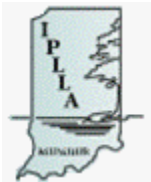
Indiana Professional Lawn & Landscape Association