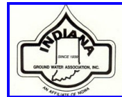
Indiana Ground Water Association